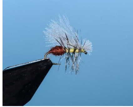
Little Mormon Girl