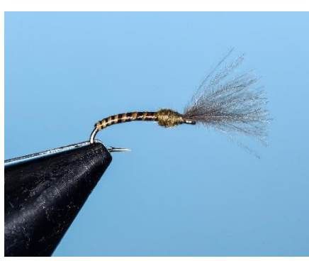
BWO Colored Emerger

1. To start, the Size 20 hook had a very productive year scoring mostly in winter on the small bug hatches of midges and BWOs. These were the fly patterns.