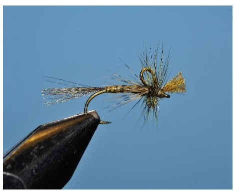
Hatching Green Drake

In the small hook (Sizes 26 to 14) category, there were some interesting results as well with power numbers following the Size 20 to 14 hook sizes. Here are the flies that shined.