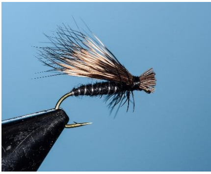
Black Get Her Done