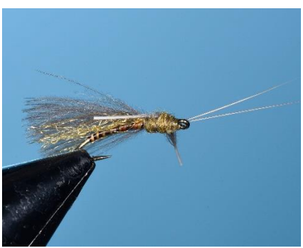
Olive Brown Emperor Caddis