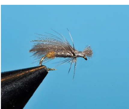
Green River Caddis

4. The 20-inch numbers continue to increase in the Size 14 category mainly because of these fly patterns.