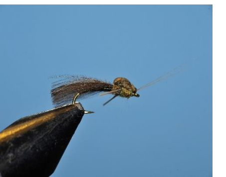
Olive Brown Meathead Caddis