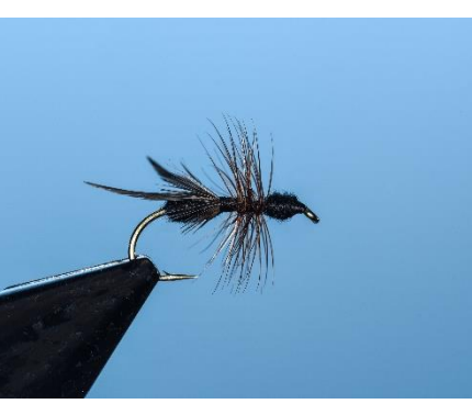
Flying Black Ant

Here's the hook study for 2023 and the previous years for your comparisons.