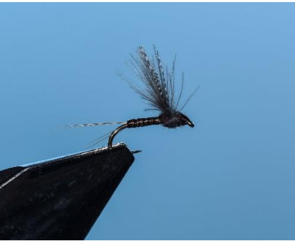
Dark Mahogany Comparadun