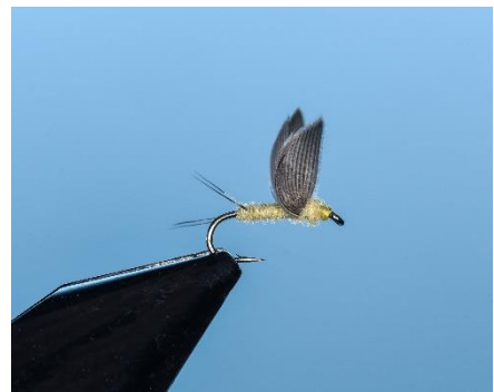
PMD No Hackle