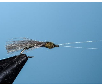
Baetis Emperor Caddis