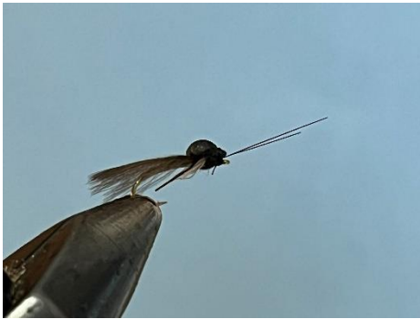
Mother's Day Meathead Caddis