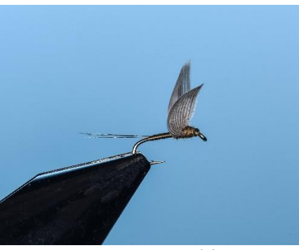
BWO No Hackle