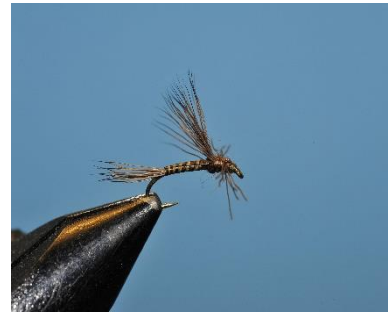
March Brown Searcher #16