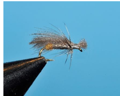
Green River Caddis #16