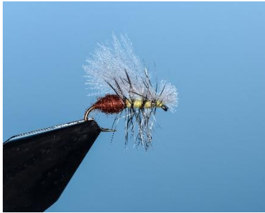
Little Mormon Girl #14