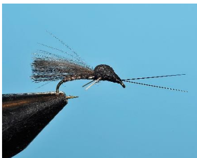
Black Meathead Caddis #16