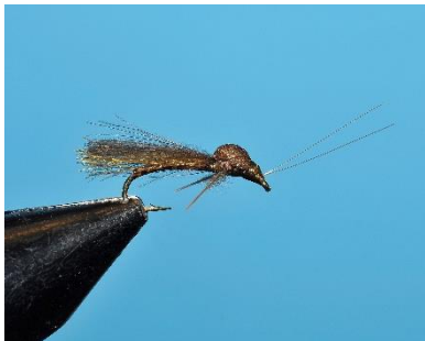
Olive Brown Meathead Caddis #16