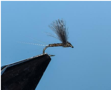
BWO Comparadun #20