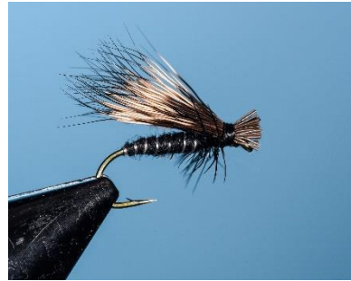
Black Get Her Done Caddis #14

3. The shocking number from last year is 64 fish landed on a Size 16 hook. That's a nuts number of big fish on a small hook, and here are the fly patterns that raised hell: