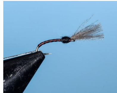
Blood Midge #20