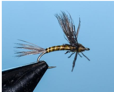
Flav Searcher #16