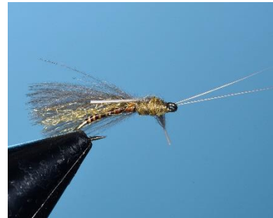
Olive Brown Emperor Caddis #18