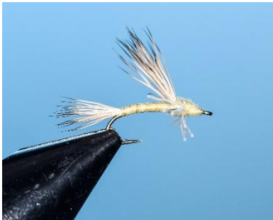
PMD Searcher #16

In a normal year fishing in the salmonfly, golden stone, and hopper windows, it usually produces more big fish on a large hook. Interestingly, I was in every one of those hatches this year, but the fish were more keyed to the smaller bugs in the system at the same time. The fish chose caddis and mayflies over stones or terrestrials. Here are some of the key small bugs used during the stone hatches: