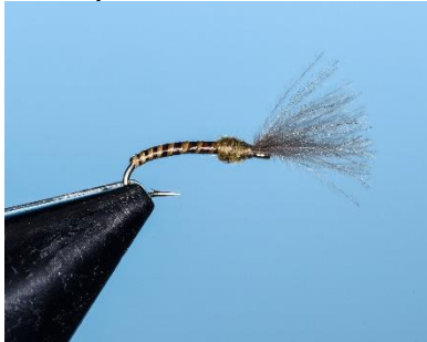
BWO Colored Emerger #20