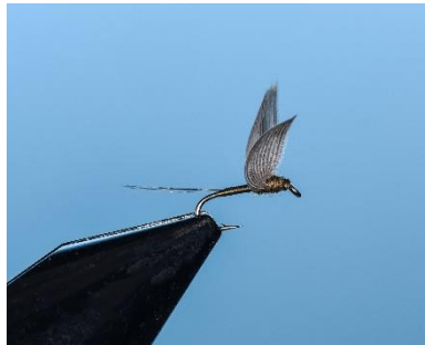
BWO No Hackle #20