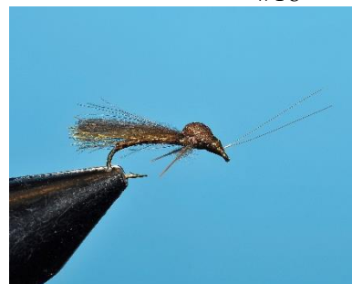
Olive Brown Meathead Caddis #16