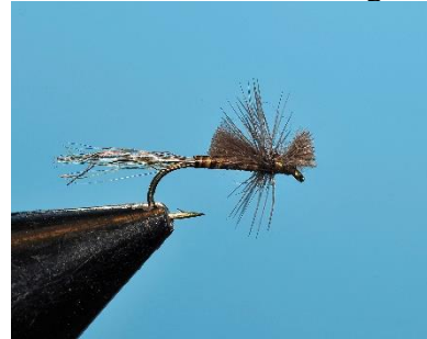
BWO Hoagie's Cripple #20