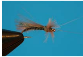
Baetis Emperor Caddis