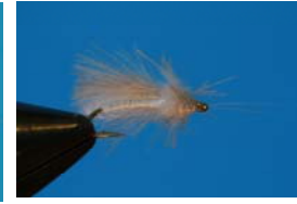
White Emperor Caddis