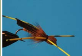
Bullet Head Hopper