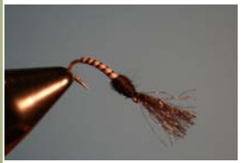
Black Emerger BS