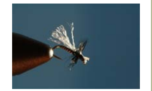
All Adult Midges