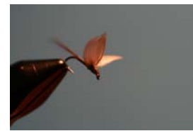
BWO No Hackle