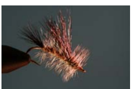
Black Gold #16, #14