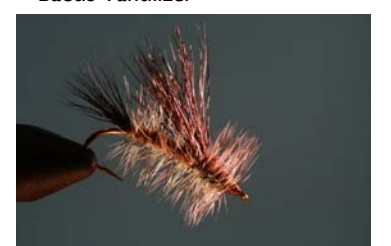
Black Gold #16 & #14