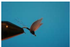
Black No Hackle