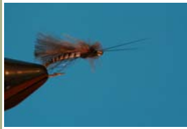
Black Emperor Caddis