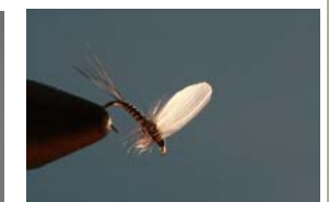
Trico Upright Adult