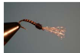
Black Emerger WS