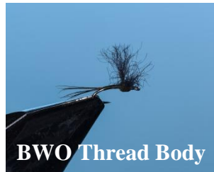
BWO Thread Body